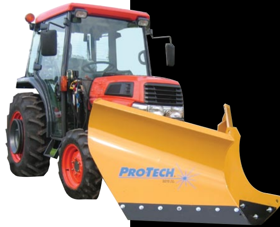
V Plow Model (VPS)