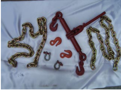
Chain & Binder Kit

Check out all of these accessories and more at www.snopusher.com