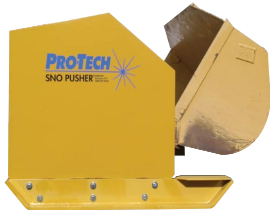
Self Leveling Shoe